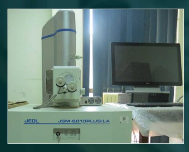
Scanning Electron Microscope EM, JSM-6010PLUS/LA, JEOL Asia Pte