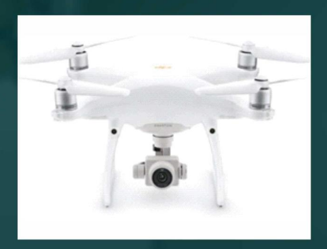
Drone, Phantom 4 Pro, DJI