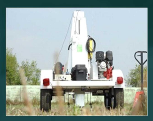
ESS1000 WITH 950-1000 Pound hammer (seismic energy source)