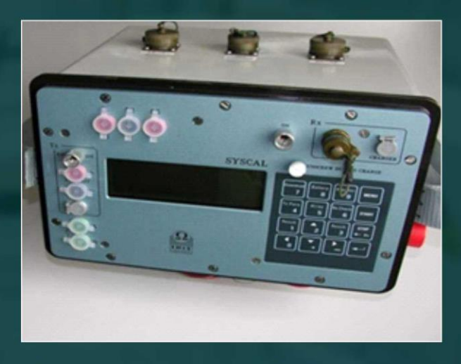
SYSCAL Junior R1 Plus Switch-72 Resistivity meter, SYSCAL Junior R1 Plus Switch, Iris Instrument, France