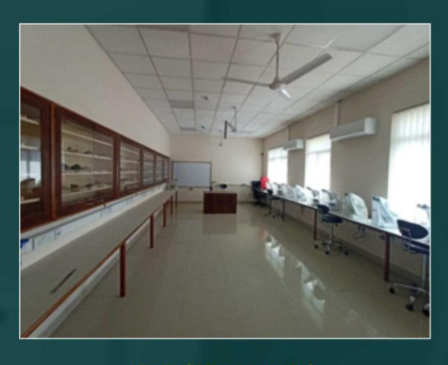
Optical Microscopy Lab